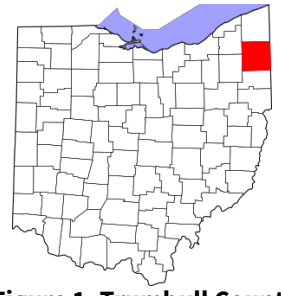
Figure 1. Trumbull County