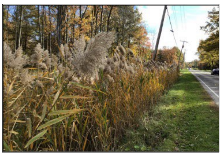
Figure 3. View of wetland along State Road

There is one intermittent stream in the project area. Additionally, a delineation showed low-quality wetlands in a number of ditches along the road throughout the project area (see Figure 3). To avoid impacting this stream and the wetlands, horizontal directional drilling will be used, or the water line will be moved to the opposite side of the road.